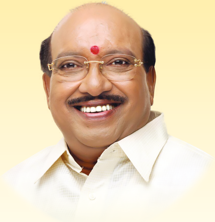
Sri. Vellappally Natesan Manager, Sree Narayana Colleges